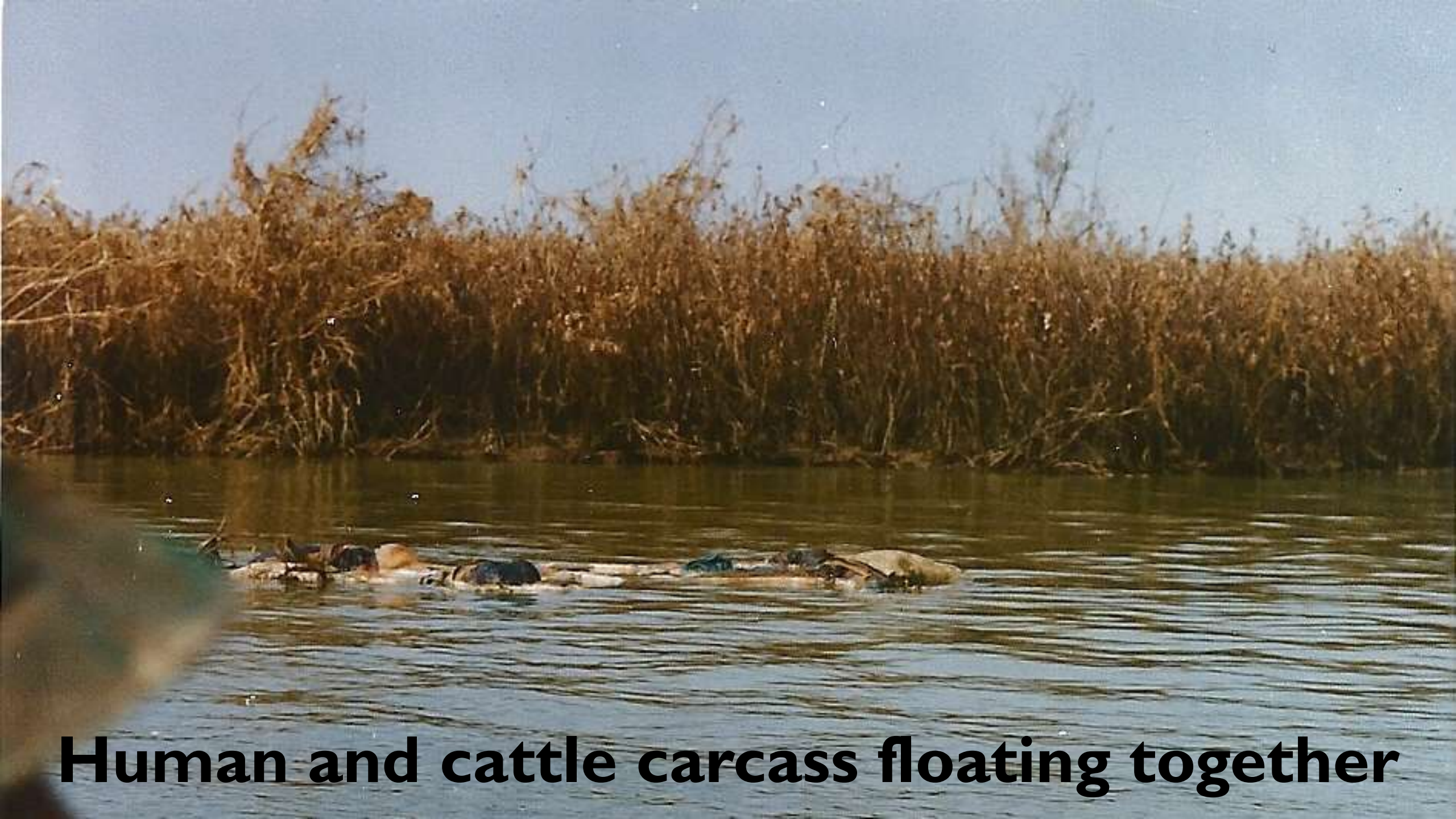
Human and cattle carcass floating together