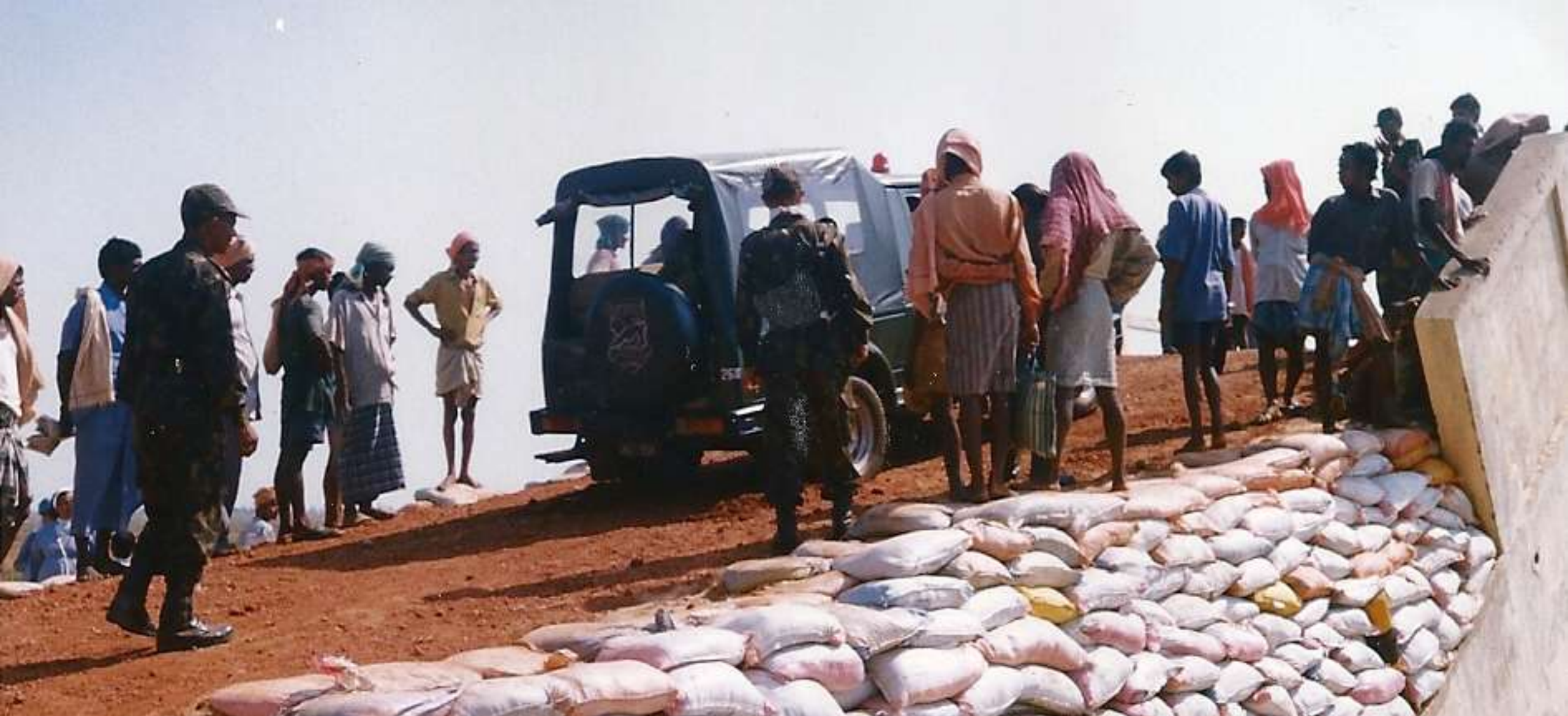
On 5 th November Commanding Officers Gypsy on test drive over a restored bridge